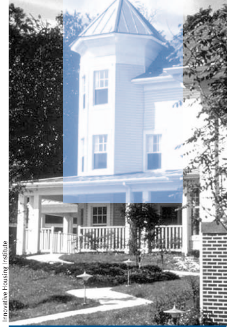
→ This is a beautiful development for seniors in Montgomery County, Maryland, developed under mandatory inclusionary zoning. The development includes housing units for households receiving public housing assistance.

Without a mandatory requirement, communities will most likely have to provide an extremely high level of subsidy to entice developers to produce homes and apartments affordable to low- and very-low-income house-holds. Voluntary inclusionary zoning programs that do succeed in generating affordable housing units for a range of low-income households must rely heavily on federal, state, and local subsidies in most cases. For example, Roseville, California, adopted its Affordable Housing Goal (AHG) program in 1988. The program encourages developers to