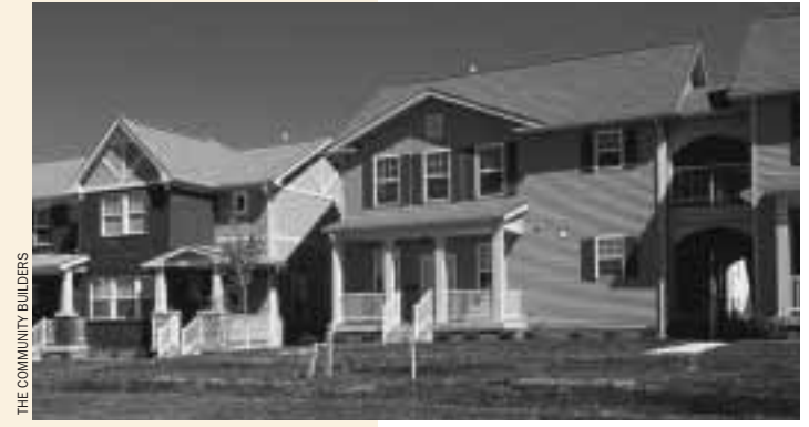
Organized according to a new urbanist master plan, Park DuValle consists of compact residential blocks in small-scale neighborhoods with attractively sited houses.

devoted substantial time and attention to the development of a pattern book (a reference for the shapes and forms of buildings in the neighborhood) for Park DuValle, based on traditional architectural styles found in Louisville neighborhoods. The pattern book represents a strategy the firm has employed with great success in community revitalization plans as well as new, market-rate developments. Designed to blend seamlessly with the surrounding neighborhoods, the residences, streets,