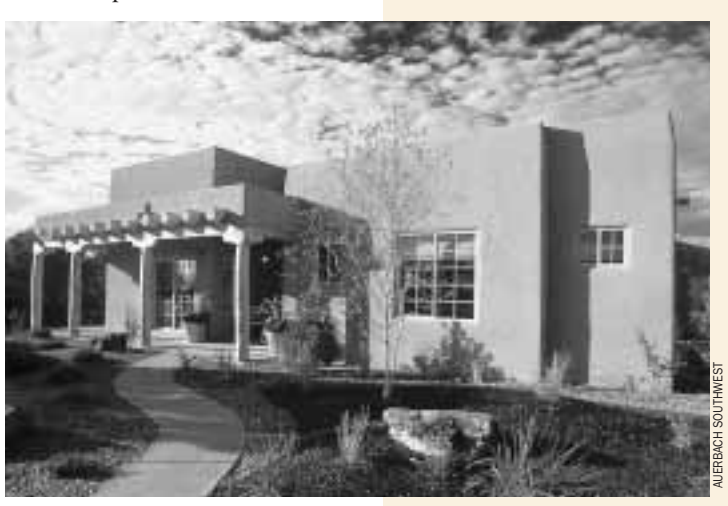
Nava Adé's residential architecture represents Santa Fe's traditional residential design, especially native adobe house styles.

architectural design to integrate visually a variety of housing products.