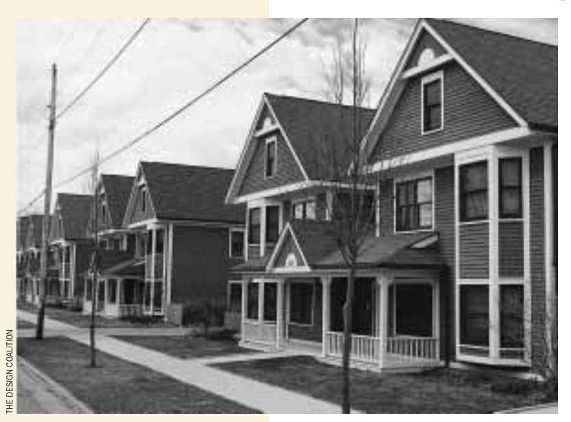
Located six blocks from the state capitol and the downtown business district in Madison, Wisconsin, the Reservoir is a resident-managed, limited-equity cooperative that helped to launch revitalization and new market-rate housing in the surrounding neighborhood.

The city of Madison owned the site and offered it to developers who would meet the city's development and design criteria, competitively selecting a nonprofit owner-architect team-Madison Mutual Housing Association (MMHA) and Design Coalition, Inc.—for the project. The units are designed as two-story flats and attached townhouses, with architectural details and a density of 18 units per acre that blend in with the surrounding neighborhood. Through a series of public meetings and negotiations over density and design issues, developers were able to overcome the initial opposition of neighbors to the project. In the end, the new housing not only made constructive use of long-vacant land—but also generated subsequent rehabilitation efforts on adjacent blocks where forprofit developers have added about 150 units both in rehabilitated warehouses and in new construction.44