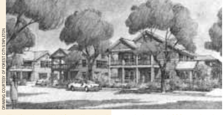
The Stapleton Workforce Housing Program designates 1,600 rental and for-sale units for households that have incomes at or below 80 percent of the area median income (AMI). Roslyn Court offers the first homes for sale at Stapleton that will be restricted for purchase by police officers, firefighters, teachers, nurses, and others with "workforce" incomes.

owner-occupied homes, each of the units will have a deed with a 30year price restriction that allows the owner to realize some of the home's appreciation in the value but keeps the price below market value. At the end of the 30 years, a nonprofit entity—created to control and monitor the for-sale unitshas the option of buying back the homes at the restricted price and re-restricting the units, or letting them be sold on the open market and collecting the difference in price.