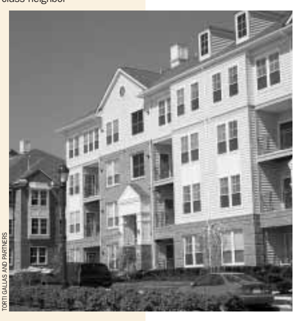
King Farm, a 430-acre, planned community in Rockville, Maryland, will include 3,200 units at buildout. As part of the MPDU program, 12 percent of the units will meet the affordable housing requirements.

Beyond Montgomery County, many municipalities around the country have adopted inclusionary zoning ordinances, such as Burlington, Vermont; Boston; Denver; Santa Fe, New Mexico; and San Diego, and many others are considering passing similar measures. In fact, most jurisdictions can trace some aspect of their inclusionary zoning ordinances to the Montgomery County program.<sup>17</sup>