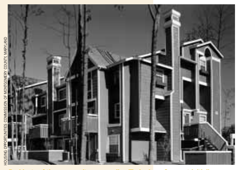
Residents of the community surrounding Timberlawn Crescent initially opposed the development. Upon seeing the actual scheme of the buildings—designed comparably to surrounding developments, as two-story townhouses over flats—they were reassured, and accepted the development.

Initially, residents of the surrounding community strongly opposed the Timberlawn Crescent development, despite numerous meetings to solicit neighborhood input during the planning process. Upon seeing the actual design of the buildings, however—with assisted units that are indistinguishable from those that are market rate—neighbors were reassured and their concerns put to rest. The development's moderate density, with buildings designed as two-story townhouses over flats, is comparable to that of surrounding communities. The architect sought to site the buildings to preserve as many of the existing tulip trees as possible, creating a buffer between buildings. <sup>54</sup>